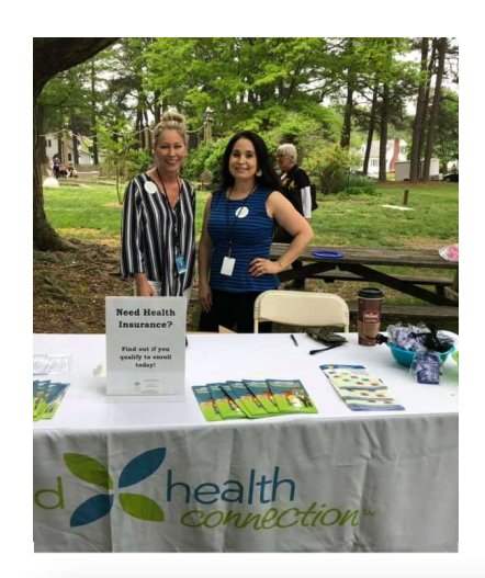
A day at the Center